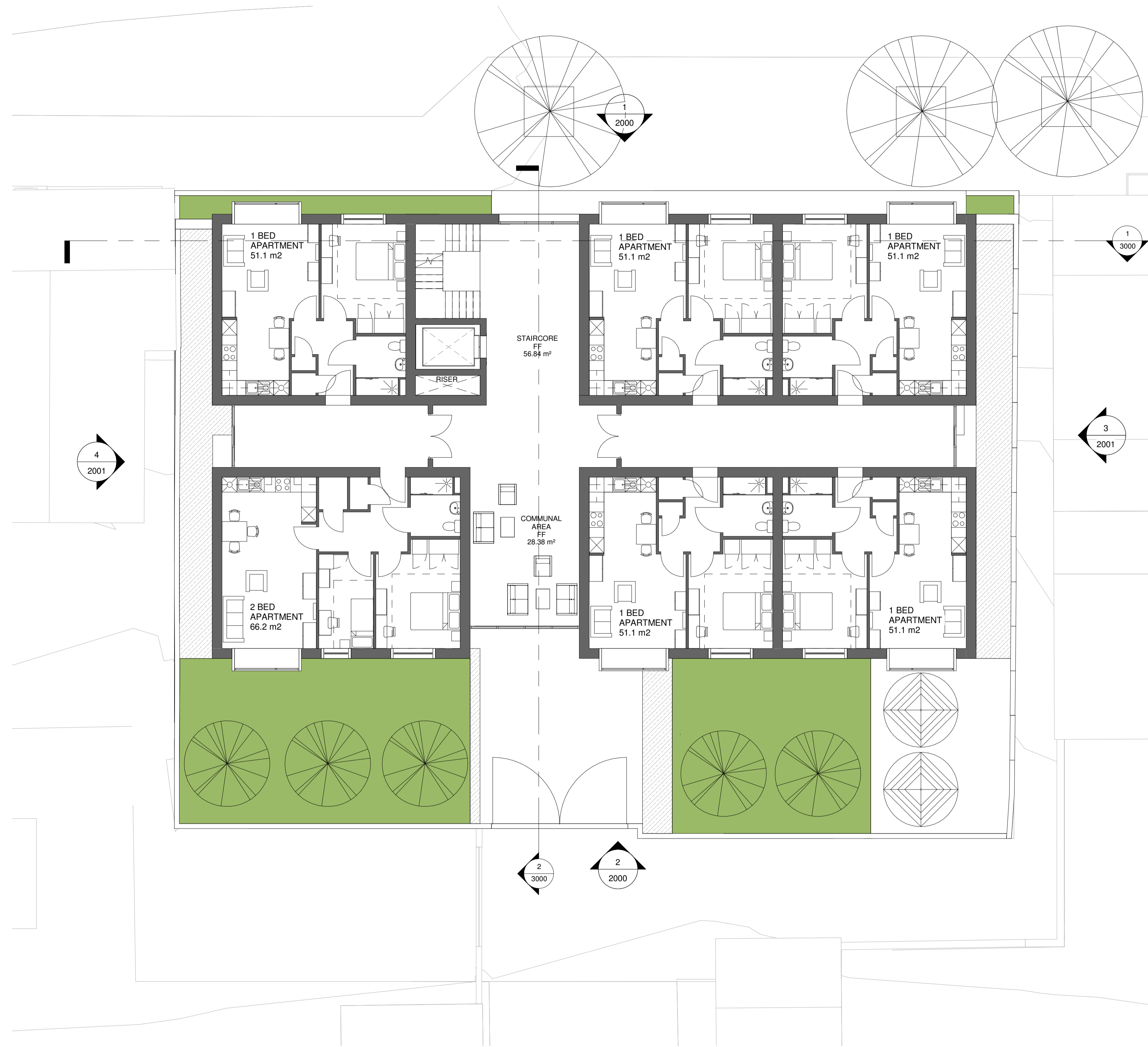
First & Second Floor Plan 1 : 100