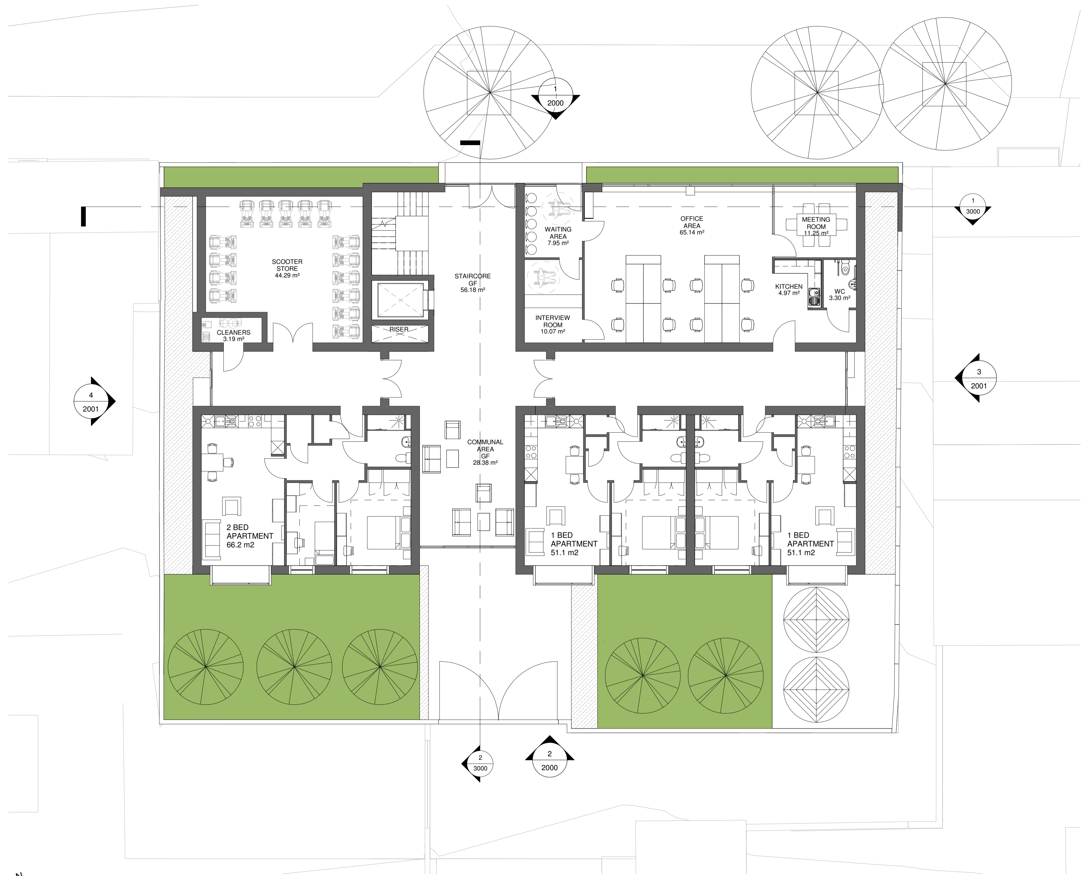
Ground Floor Plan 1 : 100