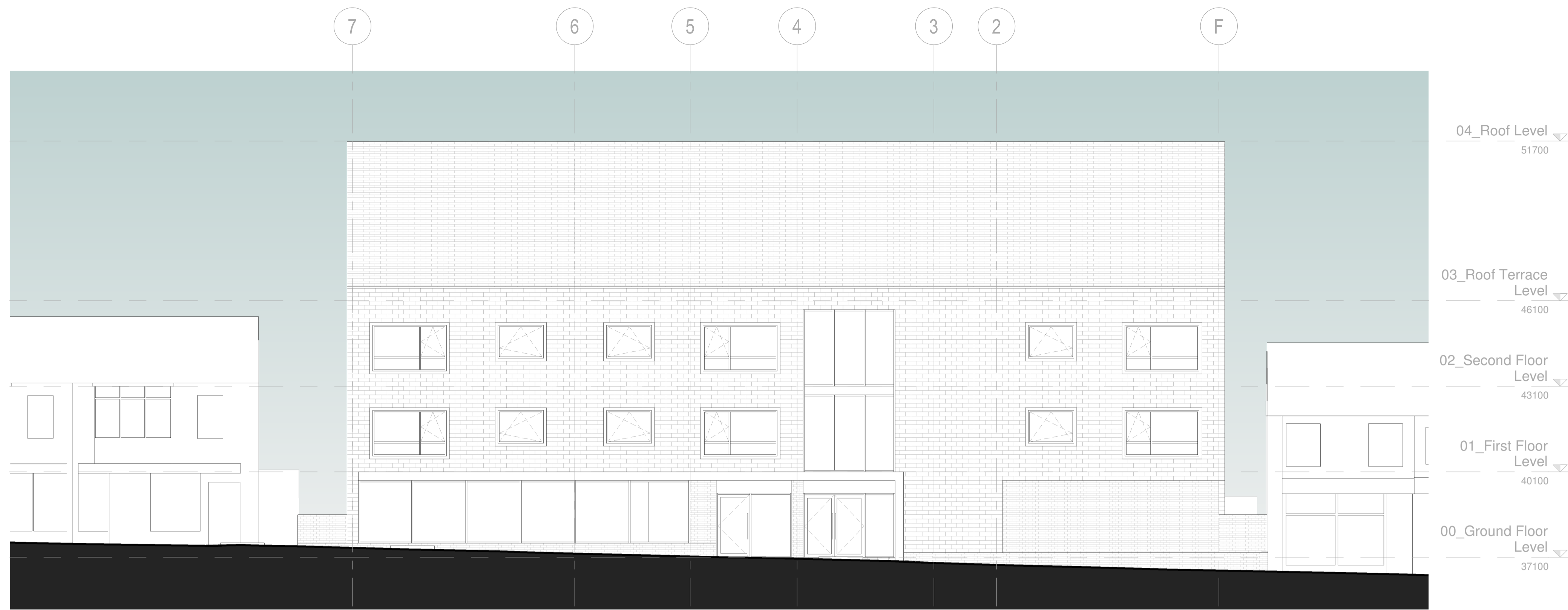
North Elevation 1 : 100