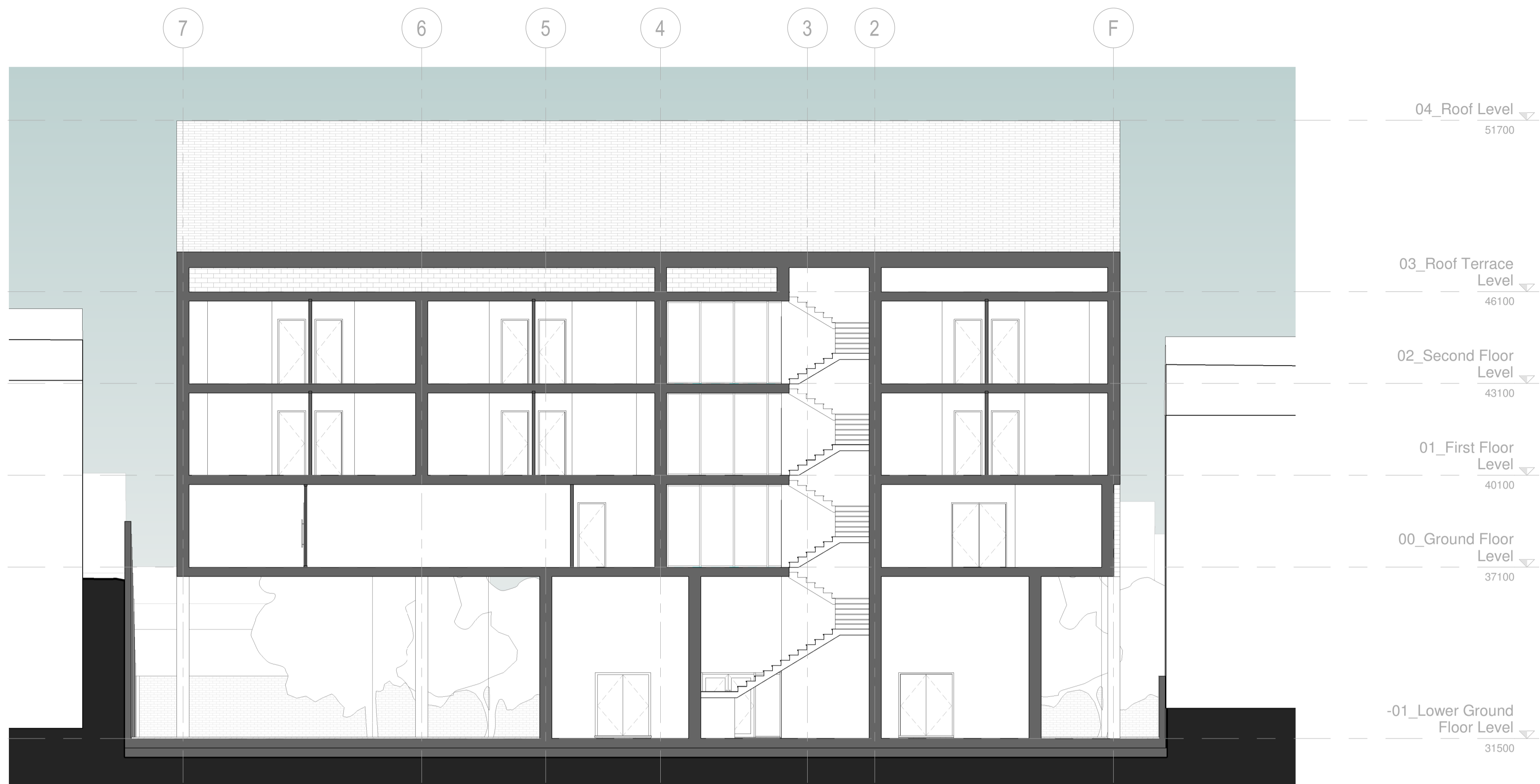
Section AA 1 : 100